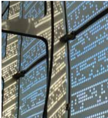
Cité de la Dentelle de Calais

Basic, emblematic, sportive and urban, origins, lively, striking, faded, dynamic, luminous, abstract, technology, nomadic, lively, positive attitude, simplified, radical, real, idealist, one world.